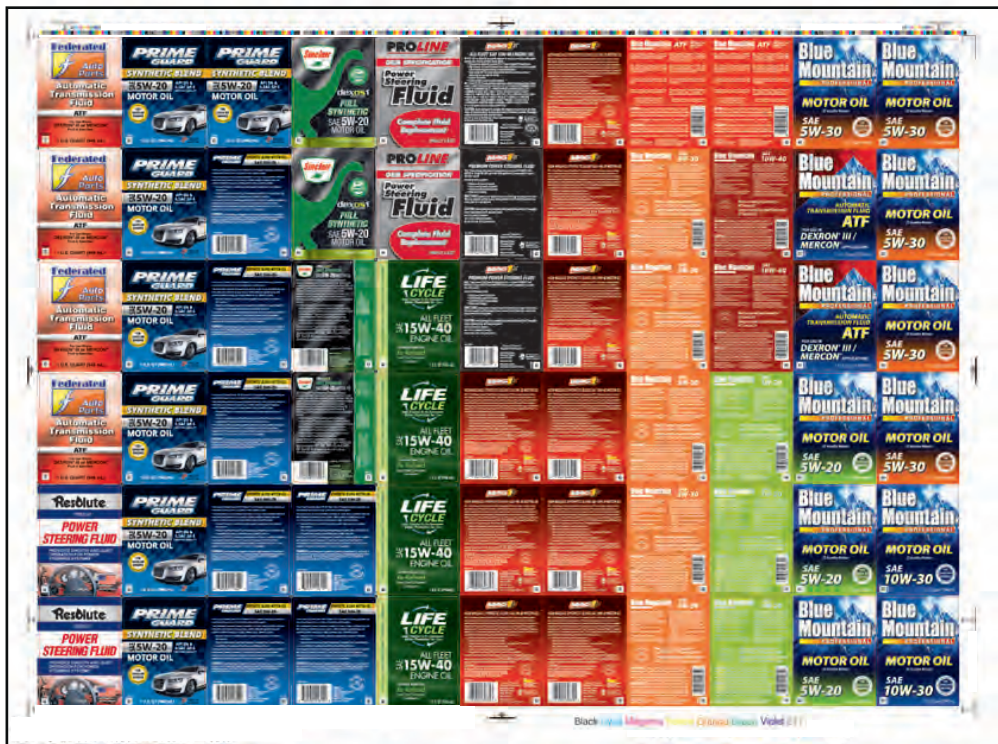
Expanded Gamut combo press runs give you amazing color and flexibility

We understand the importance of giving you options when it comes to printing. Gamse's package decorating solutions are tailored to your needs.